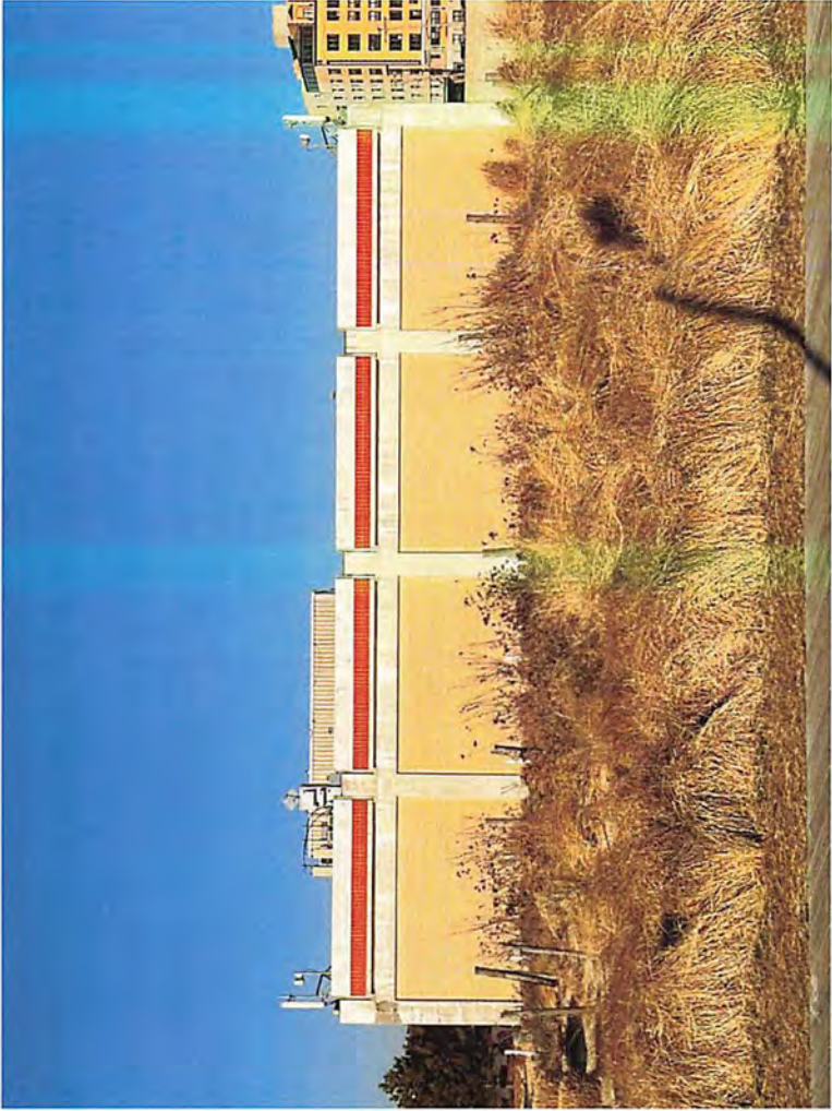
View of panels from the boardwalk